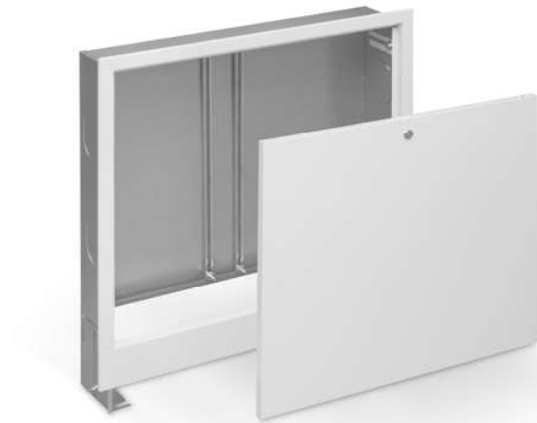
2 Flush-mounted SPE cabinet